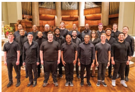
Seasons of Love