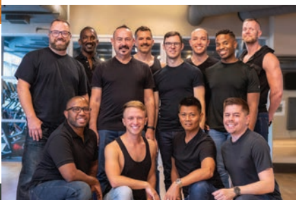
17th Street Dance