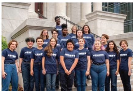
GenOUT Youth Chorus