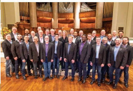
Rock Creek Singers