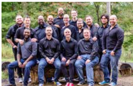
Seasons of Love Gospel and inspirational ensemble