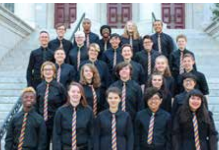
GenOUT Chorus LGBTQ+ youth choral ensemble