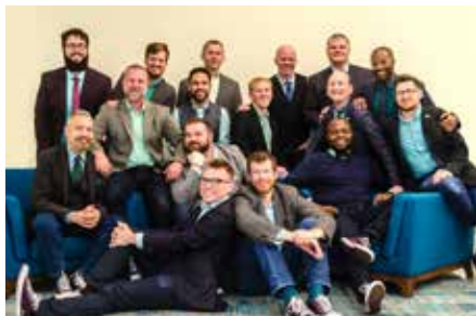
Potomac Fever a cappella pop harmony ensemble