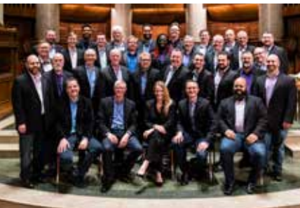
Rock Creek Singers Chamber music ensemble