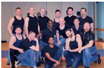
17th Street Dance Dance ensemble