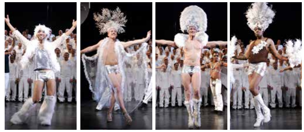
Snow Queens (Red & Greene, 2011)