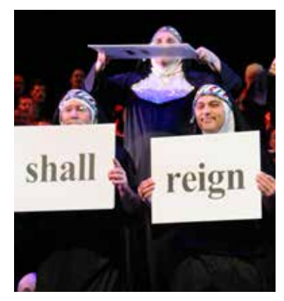
The Hallelujah Chorus Nuns ( Sparkle, Jingle, Joy , 2013)