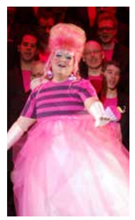
The Sugar Plum Fairy (A Pink Nutcracker, 2010)

stand out? How did a performance delight you? How did a performance move you? How is GMCW part of your holiday traditions?