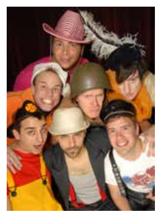
The Seven Dwarfs (Snow, 2009)

GMCW also has a history of transforming classic holiday tales and presenting them with a gay twist. Did you experience