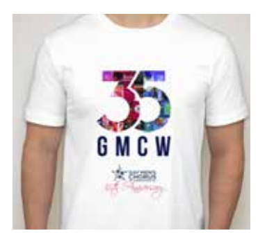
New 35th Anniversary T-Shirt