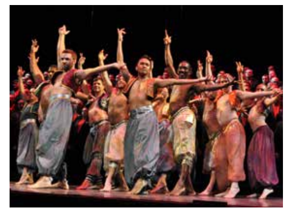
Bolly Jolly Holiday (Winter Nights, 2012)