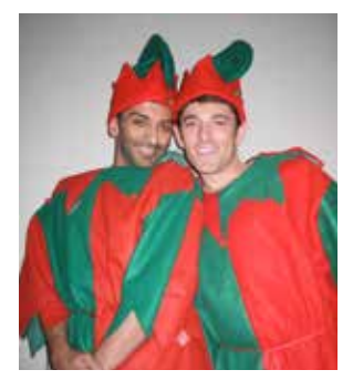
Christmas Elves (Baby It's Gay Outside, 2008)

As GMCW marks its 35 years, we invite you to reflect on your own memories of GMCW performances past. Which ones