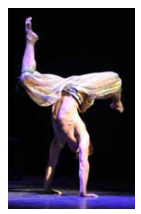
Bolly Jolly Holiday ( Winter Nights , 2012)

The GMCW Historical Society seeks to secure, share and celebrate the rich and evolving history of GMCW with its members, supporters, audience and the general public — helping build the organization's bright future. If you would like to know more about GMCW's history or to share your own memories, contact the Historical Society at history@ gmcw.org.