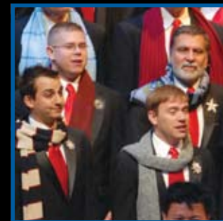
Photos include a retrospective of our 2009–2010 season including Snow , Love, Fever , Grease , rehearsal for Snow with Guest Conductor Bishop Gene Robinson and the National Equality March. All photographs by Ward Morrison except for the National Equality March courtesy of Michael Key/ Washington Blade. Following Page: Photo by Ward Morrison.