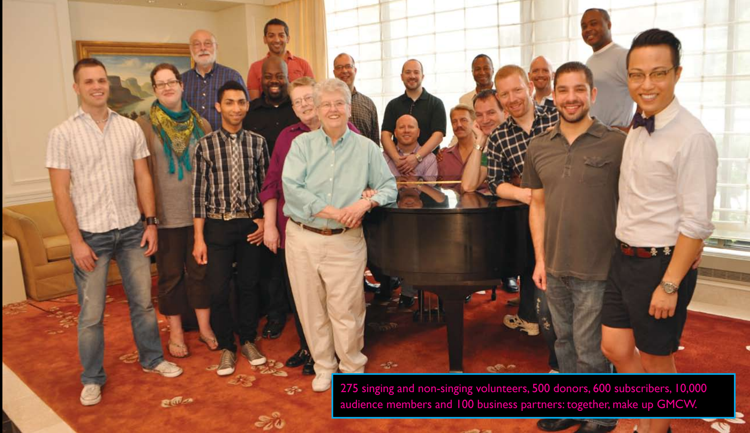
Front and Back Covers: Right

Please join us as a subscriber for our 30th Anniversary Season.